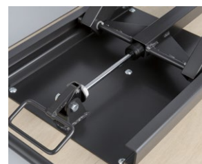
Table Height Adjustable