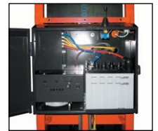
Inside unit box