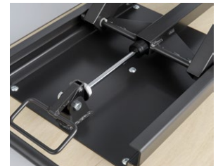
Table Height Adjustable