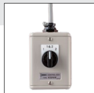
Motion select dial