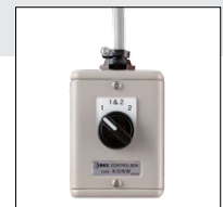
Motion select dial