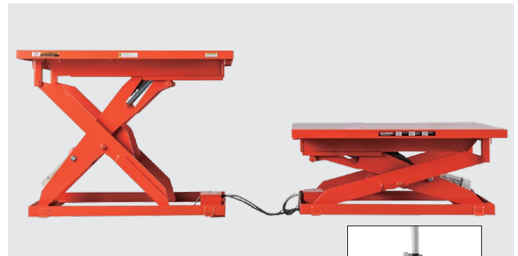
Only the left unit moves.